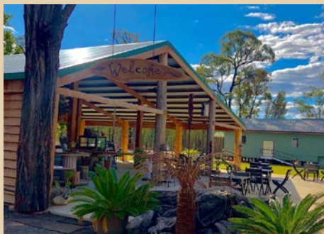
Lady of the Lake lotlavon@gmail.com 0427 870 121