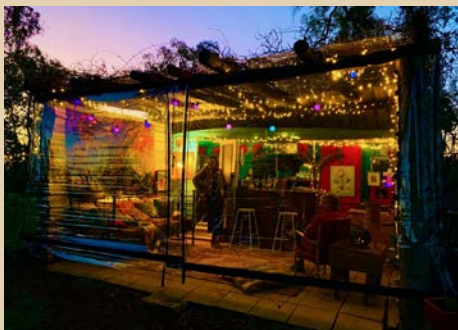
Camp Greenup 0428 179 459